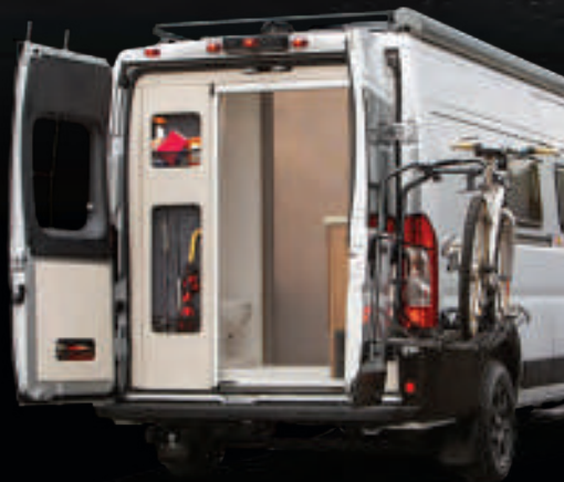
Easy to access rear bath and storage